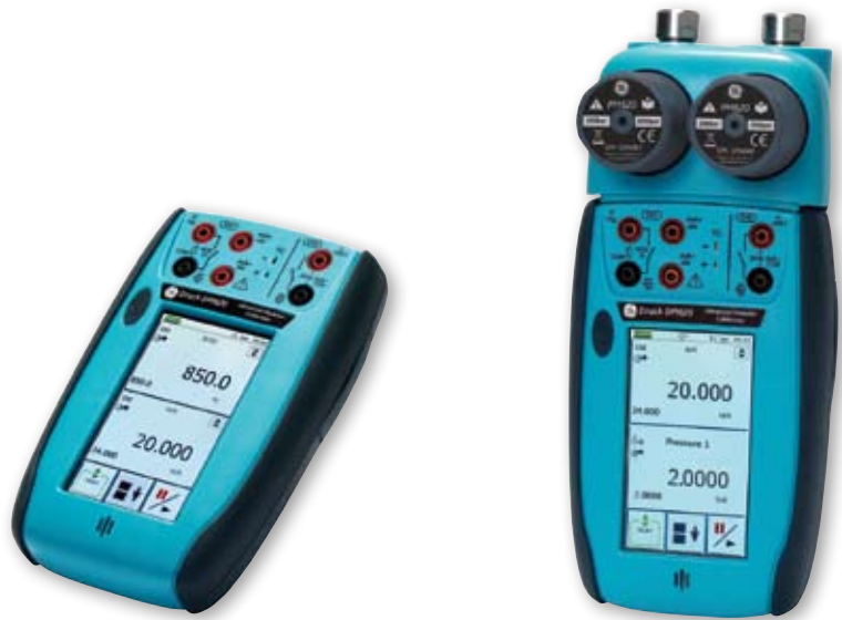
Measure and source mA, mV, V, ohms, frequency, RTD's and thermocouples.

The simple yet sophisticated design and concept combines, for the first time, an advanced electrical calibrator with state-of-the-art pressure measurement and generation, so that there is no longer any need to compromise one measurement capability in favour of another.