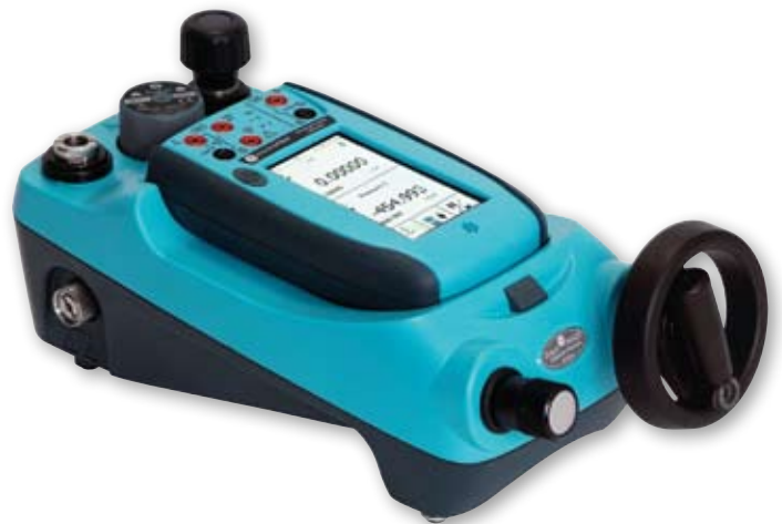
Re-rangeable pressure measurement and generation from 25 mbar (10 inH 2 O) to 1000 bar (15000 psi)